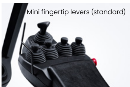
Mini fingertip levers (standard)

The driver can choose between three different hydraulic commands, perfectly positioned for easy and fast material handling. The standard easy to use mini levers are ergonomically positioned on a fully adjustable armrest. Options include two, double function joysticks or a single multifunction joystick with all functions concentrated on one handle.