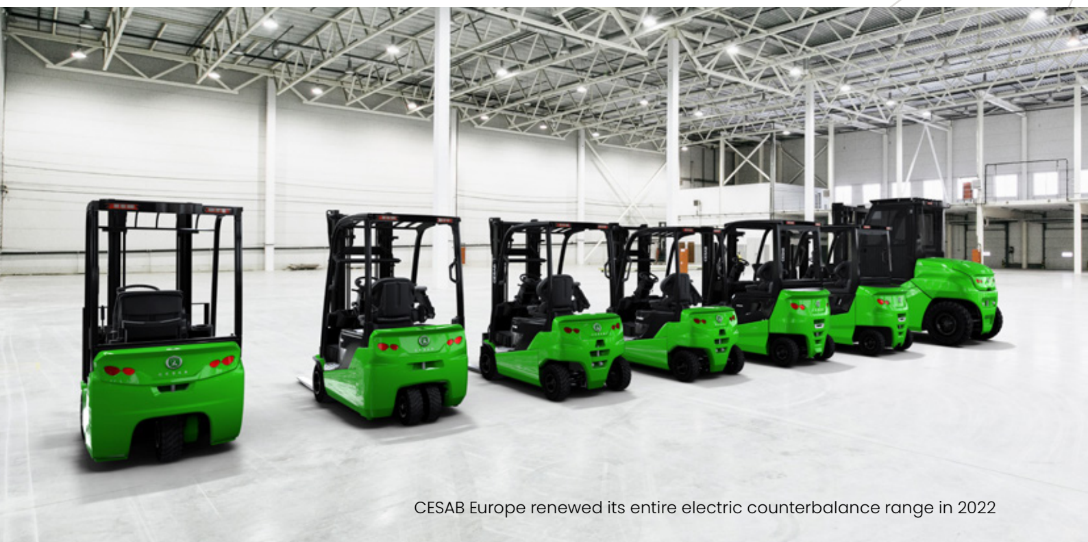
CESAB Europe renewed its entire electric counterbalance range in 2022