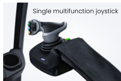
Single multifunction joystick