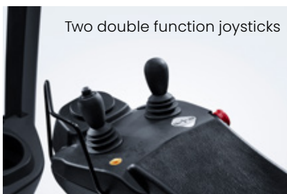
Two double function joysticks